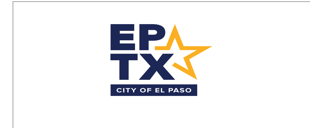
Do not stretch