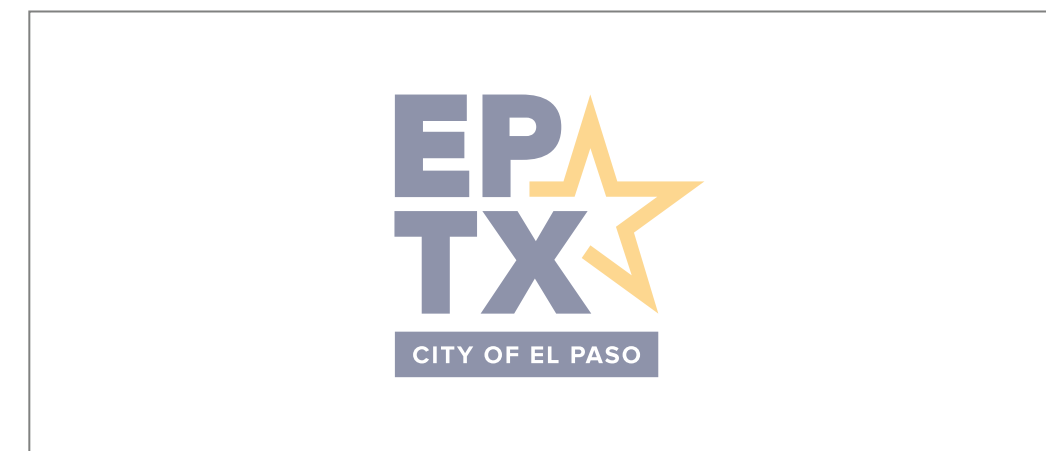
Do not apply transparency effects