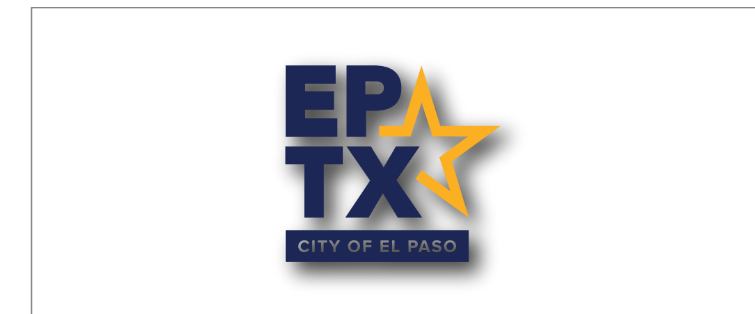
Do not use drop shadows or bevel