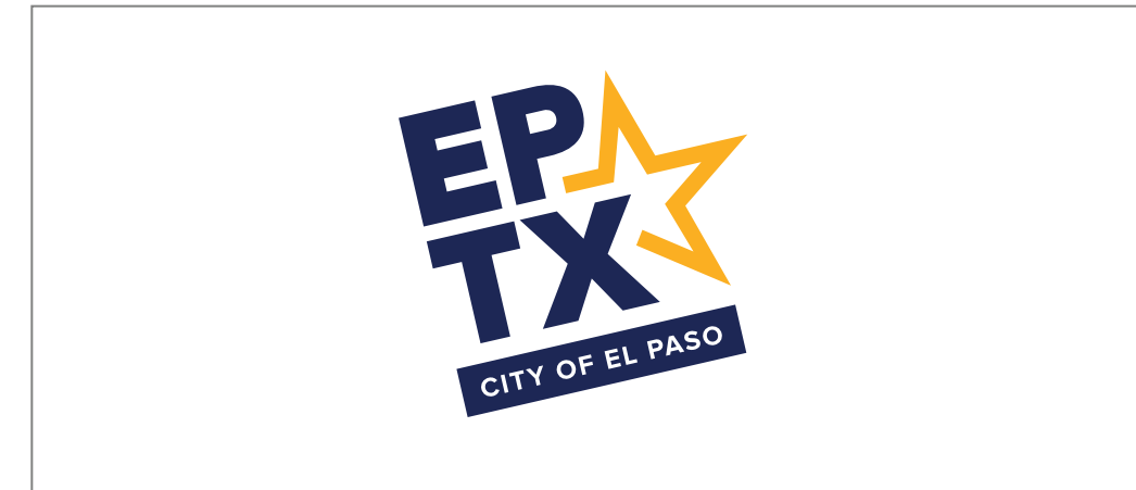
Do not rotate

When using the City of El Paso wordmark, the following rules should be adhered to at all times. DO NOT use the City of El Paso wordmark the following ways: