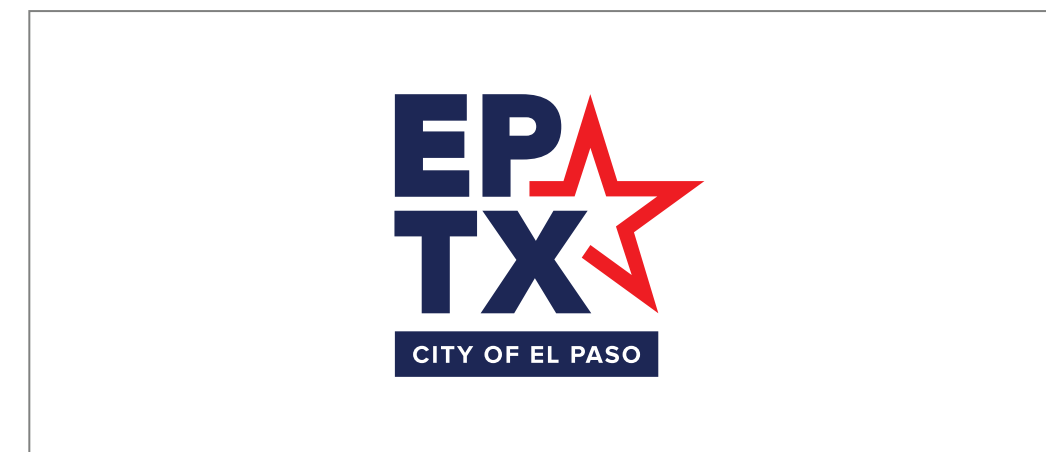
Do not change colors