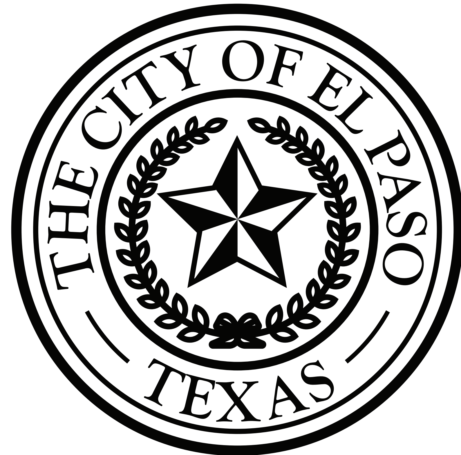
Official City Seal

If the reproduction of the seal is less than 1.0 inch in diameter, do not use the seal.